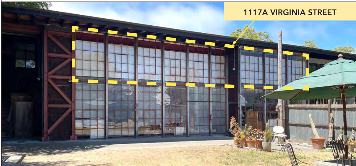
1117A VIRGINIA STREET